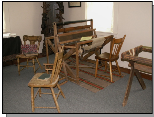
The “Gathering Room” features a loom, spinning wheel, quilting frame, and more!